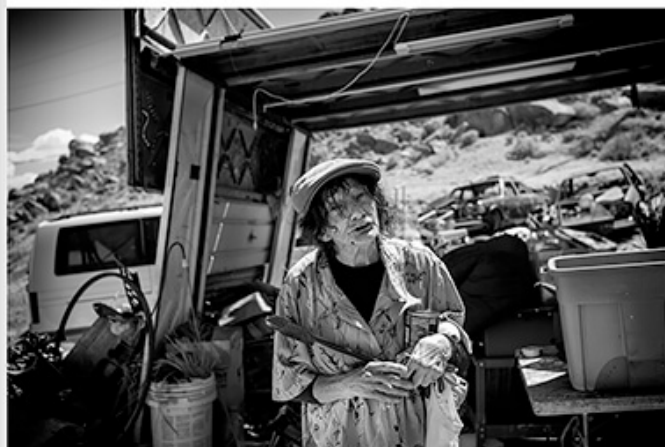
From, artist Bruce Torma, California, 1979