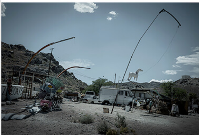
TRANS GALLERY OF SPIRITUAL LIFE, Santa Barbara, 1979